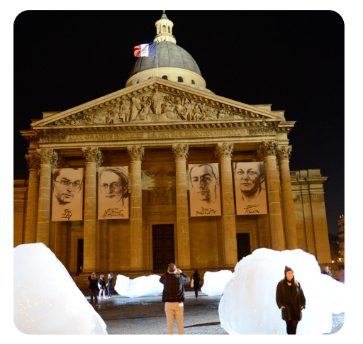
Ice Watch by Olafur Eliasson, 2015

This art installation is made from chunks of ice taken from icebergs off the coast of Greenland. The artist wanted people to watch the artwork melt away to bring them closer to climate change in action.