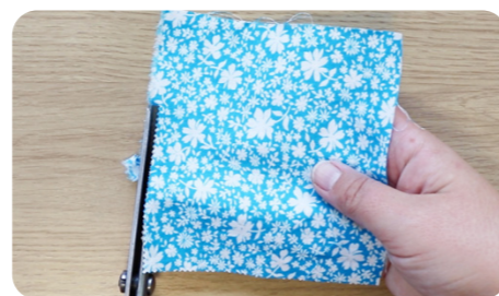
Trim the edge of the fabric with pinking shears.

A hem runs along the edge of a piece of cloth or clothing. It is made by turning under a raw edge and then sewing to give a neat finish to the fabric and to stop it from fraying.