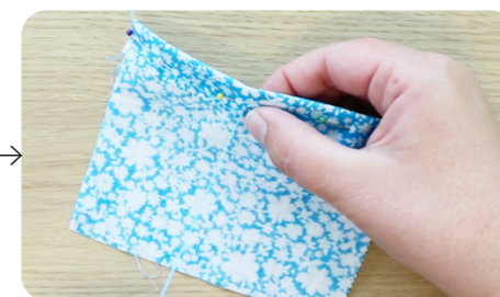
Use a needle and thread to sew running stitches along the hem.