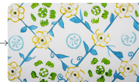
Repeat with other blocks and colours until the pattern is complete.