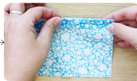
Turn the edge of the fabric over to make a 1.5cm hem. Pin it in place.