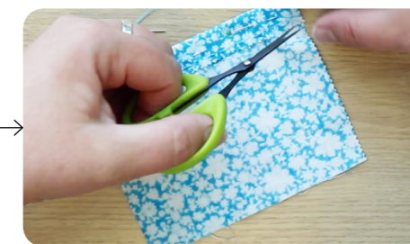
Tie a knot at the end of the hem and cut the thread. Iron along the crease to flatten the hem.