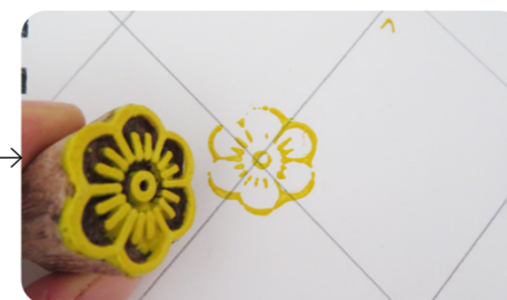
Press the block onto a piece of paper or fabric.