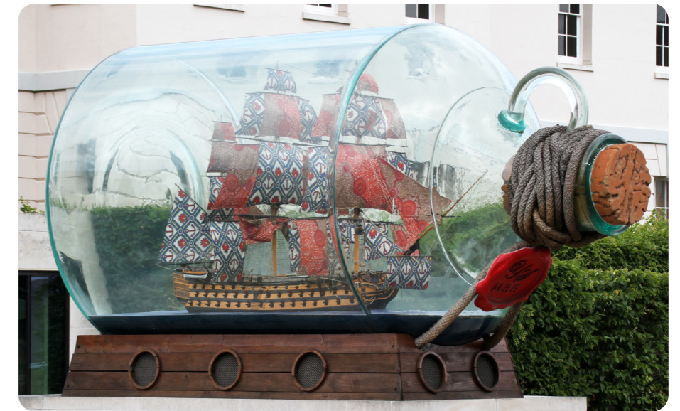
Nelson's Ship in a Bottle

Nelson's Ship in a Bottle (2010) by Yinka Shonibare was the first commission for Trafalgar Square by a black artist. It symbolises and celebrates the story of multiculturalism in London.